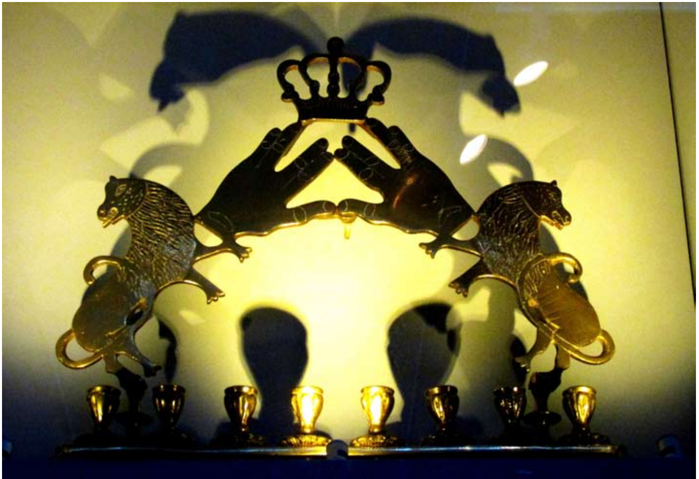
Chanukiah in the Israel Museum, Jerusalem. Happy Chanukah!